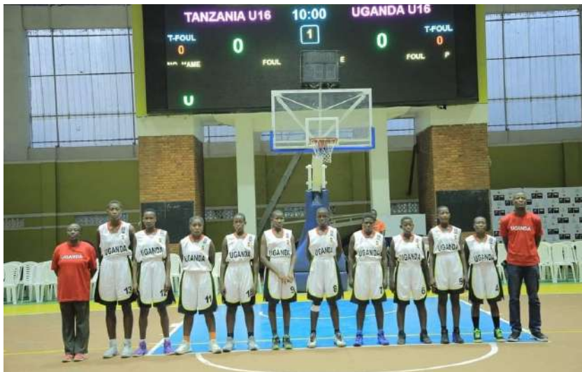
Two girls making the U16 National Basketball team.