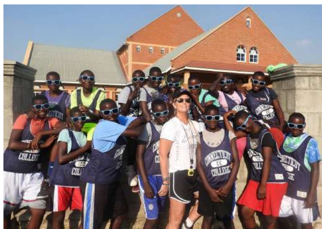
Cool and Silly before hot and serious practice singing praises in front of our Emmanuel Cathedral.

"Sports produces empowering young girls, stimulating leadership qualities and building self-esteem which helps reduce chances of early pregnancy and promoting change in these at risk communities"