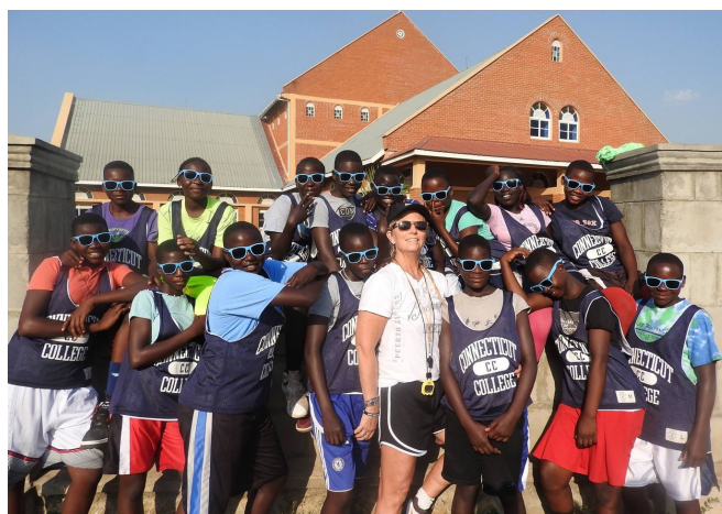
Cool and Silly before hot and serious practice singing praises in front of our Emmanuel Cathedral.

"Sports produces empowering young girls, stimulating leadership qualities and building self-esteem which helps reduce chances of early pregnancy and promoting change in these at risk communities"