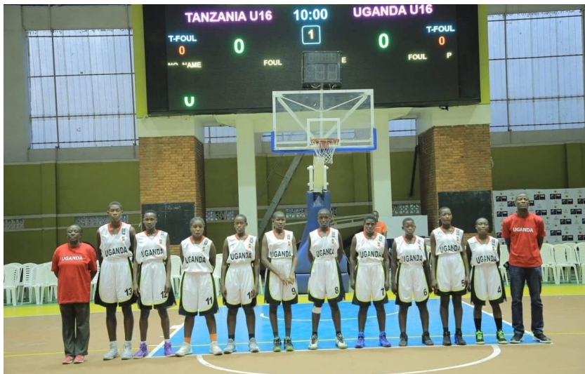
Two girls making the U16 National Basketball team.