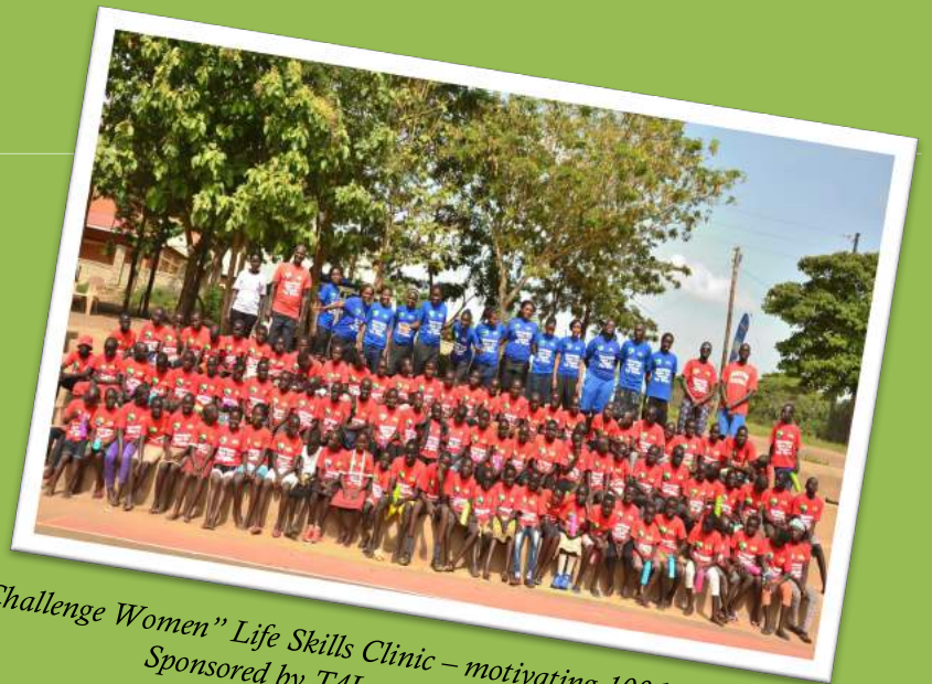
"A1 Challenge Women" Life Skills Clinic – motivating 100 boys and girls. Sponsored by T4L and Lift Up Africa

HONORING OUR TEAMMATE In Loving Memory 1938 - 2018