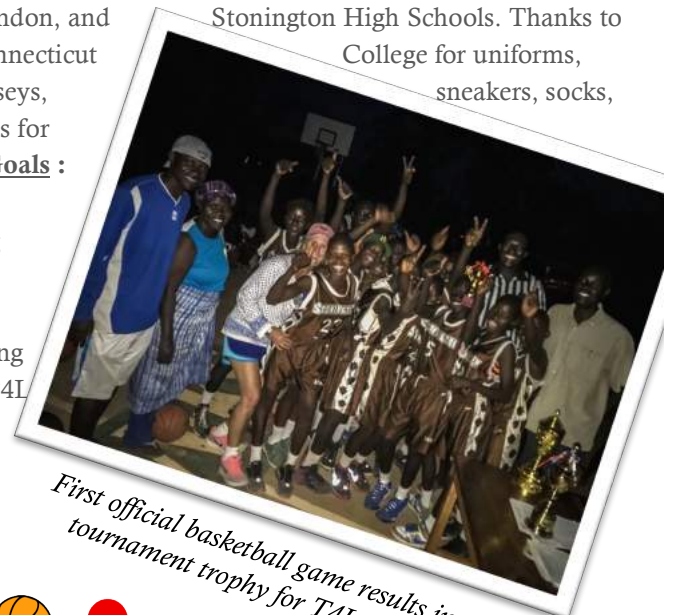
First official basketball game results in tournament trophy for T4L girls.

Many Teammates for Life (T4L) success stories from 2017 and promises for 2018. God is truly Great! Highlights of 2017 include; local fundraising events in Mystic/Stonington area - Saltwater Farms Vineyard, Mystic Art Festival and Mystic Seaport Oyster Festival Raffle, Calvary Church, Pfizer, and Lobsterboys, each generating local awareness and much needed funds. Thank you for your support! Donations from USA Girls Basketball Teammates; New London, and Stonington High Schools. Thanks to St. Michaels, and Connecticut College for uniforms, reversible practice jerseys, sneakers, socks, and balls; preparing us for another year. 2018 Goals : Exposing players to competition, securing property for future development, and producing a storytelling documentary about T4L